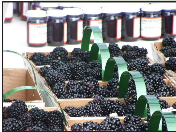
Blackberry festival, Lenoir.

Trying to start a new farm product-themed festival or event? Look particularly for something people can't find anywhere else – foods unique to our region or culture. There's probably a strawberry festival or two in every state in the union, but only Marion celebrates livermush, and only Black Mountain celebrates sourwood honey.