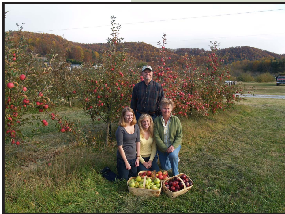
Creasman Farms, Edneyville.