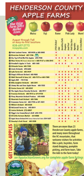
A panel from a single county, producer group farm directory.

Farm trails are simply a way to organize farms by route, location, or theme. The fruit trail in Fresno County, CA was organized by the growers themselves, and is promoted as a destination by local tourism authorities. Sandy