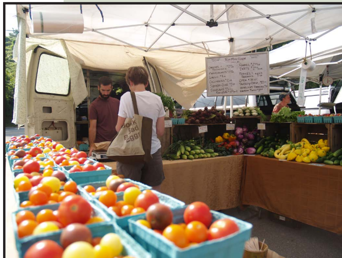
A diverse selection of produce. Ten Mile Farm at Asheville City Market.

Perhaps the most widespread trend is diversification. When farms use this word, it refers to product diversification (growing a mix of crops) and/or market diversification (reaching out to a mix of buyers). Henderson County farmer and ASAP board member Danny McConnell says it best: “20 years ago our farm grew one product (apples) and had one customer (Gerber). Last year, more than 3,000 people bought our farm products, we sold to multiple wholesale buyers, we grew more than 25 produce items, and we made some of our produce into jam and ice cream. These days, farms that don’t adapt, don’t survive.”