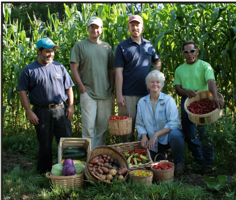
Agriculture creates jobs. Fields of Gold Farm, Henderson County.

The growth of interest in local farm products from individual, business, and institutional buyers is documented and quantified in ASAP's Growing Local research report, published in 2007. This demand, coupled with a relatively sudden surge in available farmland and farming skills presented by the tobacco buyout, creates a perfect storm of economic growth opportunity. With the right tools and practices in place, your county or community can create farm jobs, grow tax revenue, generate capital investment, and build pride by developing its farm sector.