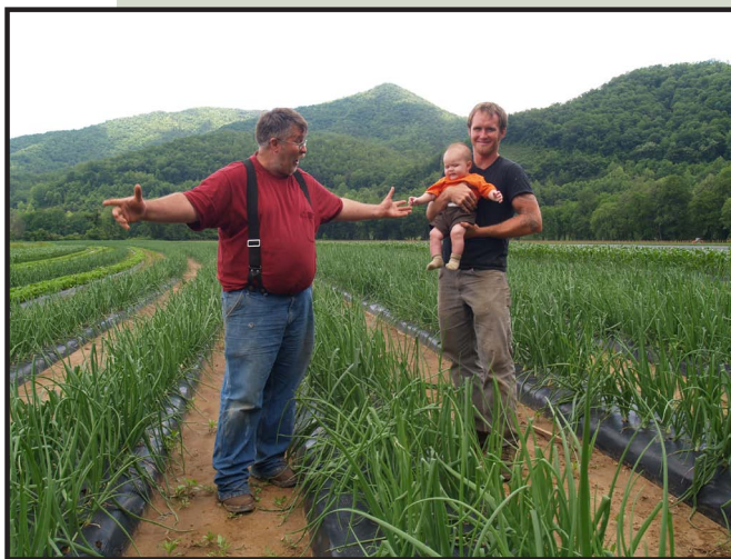
Three generations of Darnells in the sweet onion field.

And so it went: in the second half of the 20th century, we lost most of our farms, just as we lost most of our mom-and-pop shops and manufacturing businesses. The farms that survive and continue to grow products for export from our region are typically those who have diversified—growing several products, or selling through several market channels. In other parts of North Carolina, some farm industries built for global distribution still work well today. NC sweet potato growers are just one of several examples. But here in the mountains, commercial-scale farming, while still existent and important, is a shadow of what it once was. The 2004 tobacco buyout (eliminating a quota system that kept prices high) was the final straw, and by 2007 we had lost more than three-quarters of the tobacco growing income our region enjoyed just five years earlier.