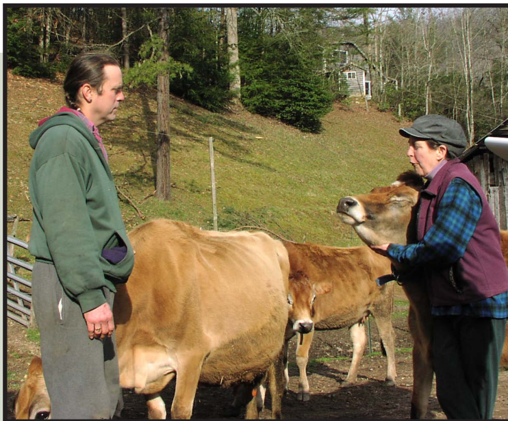
Yellow Branch Farm, Graham County.

When farmers are part of Chambers of Commerce, citizen committees, elected governing bodies, and other decision-making structures, work on behalf of farms can become embedded in existing processes rather than haphazard, and the needs of farms will not be forgotten.