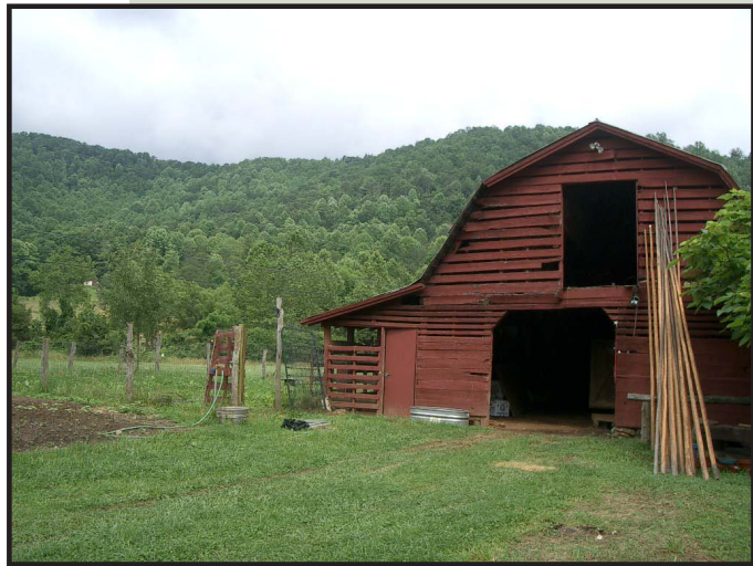
Even simple structures on working farms add scenic value to rural areas.

This is a wise policy because the renovation of a farm building represents an entrepreneurial investment in the future of the farm business, a commitment to keep farmland open and working, and an attempt to modernize and keep up with industry changes. New York also offers a tax exemption for renovations of historic barns. The barns must predate 1936 (North Carolina would likely need a later date) and must have been built to store equipment, farm product, or livestock. Barns renovated for housing are not eligible. The tax code for barn renovations goes beyond just an exemption and provides a tax credit for 25% of the renovation cost.